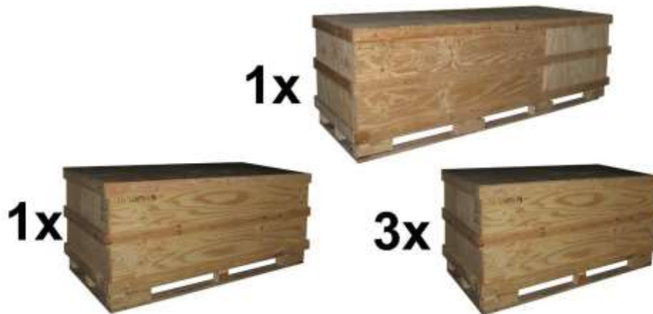
Figure 1 All Crates