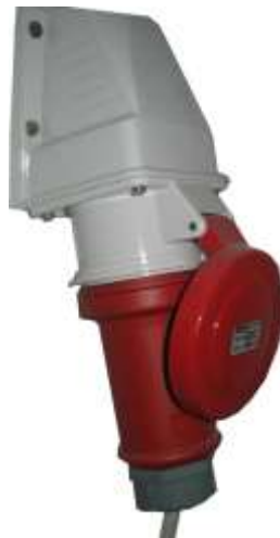
Figure 4 IEC60309 Plug and Socket reference picture

External overcurrent protection 208Y/120V, 40A max, 10 kA interrupting capacity.