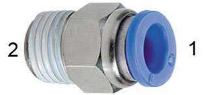
Figure 5 Pneumatic Connector Reference Picture